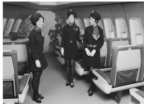
Japan Air Lines flight attendants on the upper deck of a Boeing 747 C. 1970.

The exhibition, Japan Airlines in Posters , presents a colorful selection of vintage, full size travel posters typically produced in the 1970s to promote its many Asian destinations.