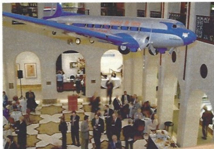
Members and guests of the San Francisco Aeronautical Society enjoying their 2003 Annual Reception.