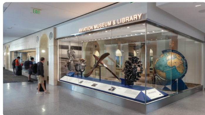
SFO Aviation Museum