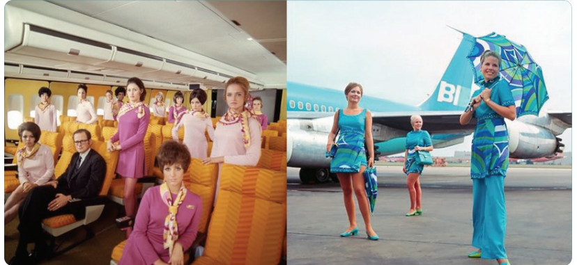
Left: Pucci III "Classic" Hostess Uniforms, c. 1968

donation. Thanks to the contributions of the Society members and supporters SFAS continues to acquire significant pieces, which enhance the museum and archive collections and help to preserve aviation history. Once catalogued, all of these items will be included in the SFO Museum online collection for public viewing and they will surely be a part of future exhibits!"