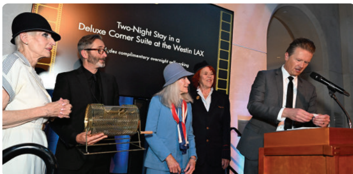
Exciting raffle during the event