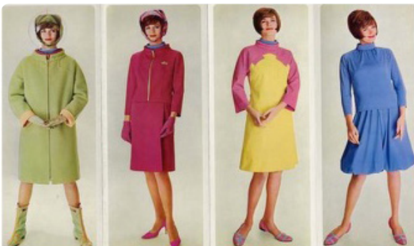
Pucci I "Air Strip" Passenger Service Uniform, c. 1965

Thanks to the contributions of the Society members and supporters SFAS continues to acquire significant pieces, which enhance the Museum and archive collections, and help to preserve aviation history.