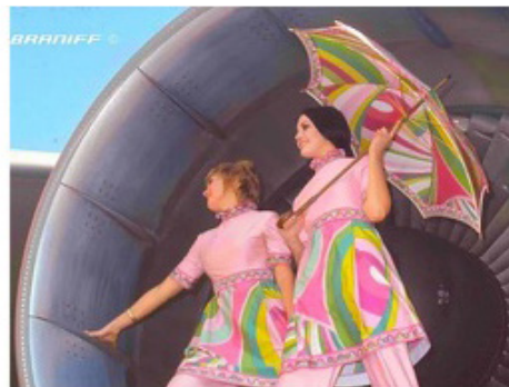
Pucci IV Hostess Uniforms, c. 1971